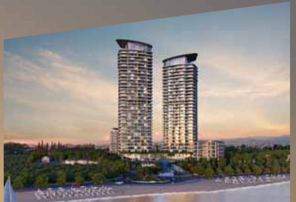
Limassol Blu Marine