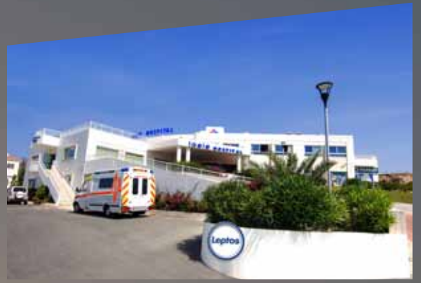
Iasis Private Hospital