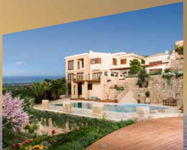
Kamares Spring Villas