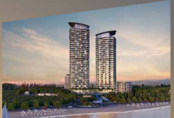
Limassol Blu Marine