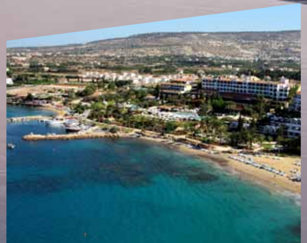
Coral Beach Hotel & Resorts