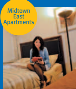
Midtown East Apartments

Midtown Studios Studio apartments are fully-furnished, within walking distance from the school. Perfect for professionals, executives and mature students, this option offers full privacy and the independent lifestyle of living in an apartment in New York City. Minimum stay is one month.