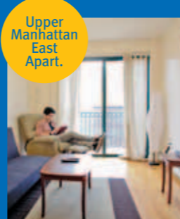
Upper Manhattan East Apart.

Midtown East Apartments Suitable for professionals and mature students, these fully-furnished, two-bedroom apartments located minutes from the school offer flat screen TVs, large beds, full living room, kitchen and bathroom. Shared with one other Rennert student, weekly cleaning, internet access and cable TV are all included. Minimum stay is 14 days.