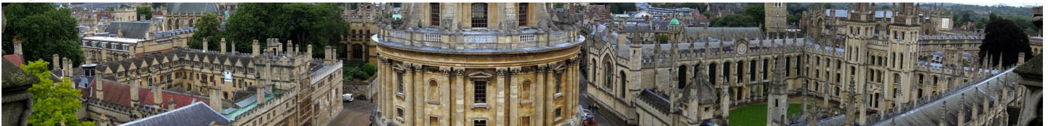
TOUR OF OXFORD