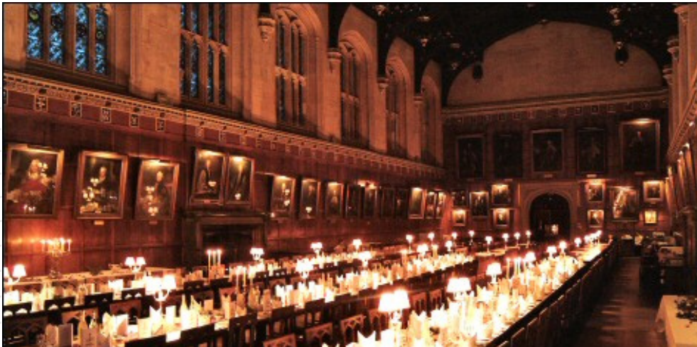
CHRIST CHURCH FORMAL DINNER

Oxford X attendees are invited to take part in a welcome dinner at Christ Church, the most famous dining hall in Oxford, renowned for its grand architecture and its association with J.K Rowling's Harry Potter. Punting is a truly timeless, slightly eccentric yet quintessentially Oxford, idyllic pleasure, and participants will enjoy the mesmerising scenery whilst drifting down the River Cherwell. Furthermore, a private walking tour of Oxford will provide participants with a greater sense of the City of Dreaming Spires, discovering both the well visited and lesser known highlights in Oxford. The tour includes visits to several Oxford colleges, the City Walls, the Sheldonian Theatre and University Parks. In addition, to foster competitive spirits, a croquet tournament has been organised which will provide a unique experience of Oxford summer activities. Tennis courts, croquet sets, pool tables and tennis tables are also available throughout the duration of Oxford X for participant use.